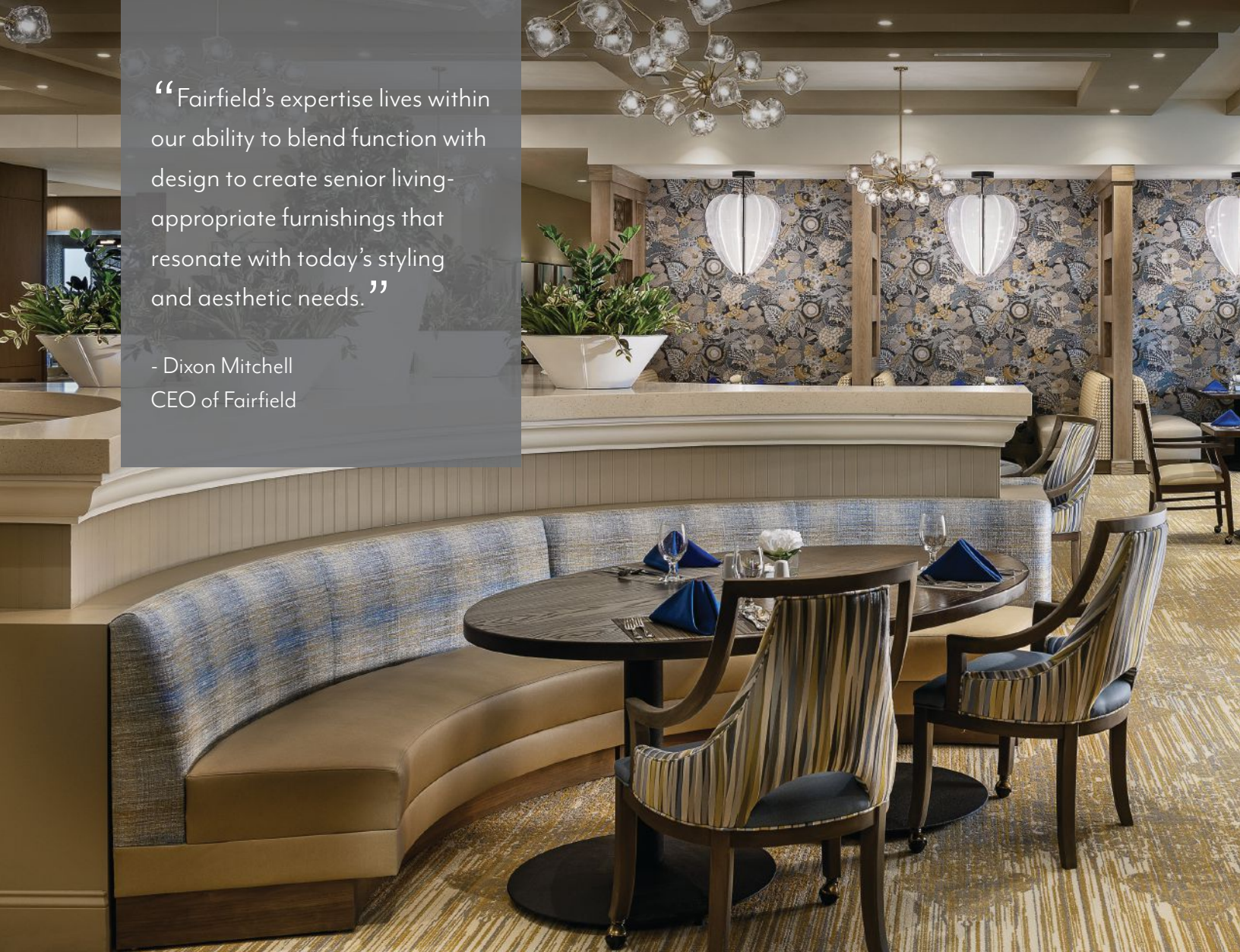
Installation: The Landing Alexandria. Featuring: Palmer Arm Chair, 8749-C2.