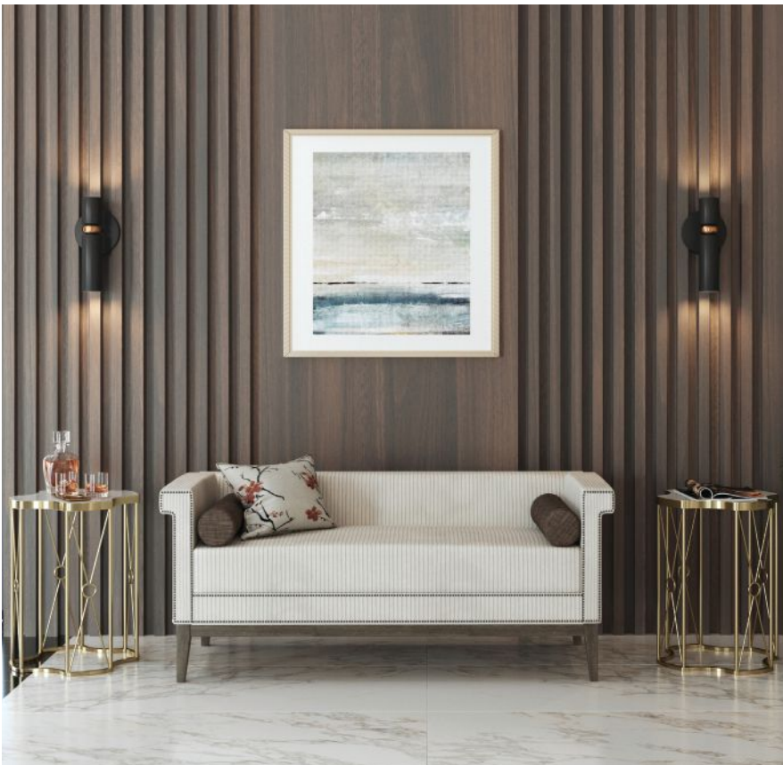
Featuring: BenchMade Bench, S-33TF-10, East Camden Accent Table, 8098-AT.

“Fairfield is a great partner for SFCS when we are looking for furniture solutions. The quality is wonderful and holds up so well. They pay attention to the anthropometric measurements that are so important for seniors. And they provide the durability and cleanability that is critical for the staff who are responsible for maintaining these important living spaces.”