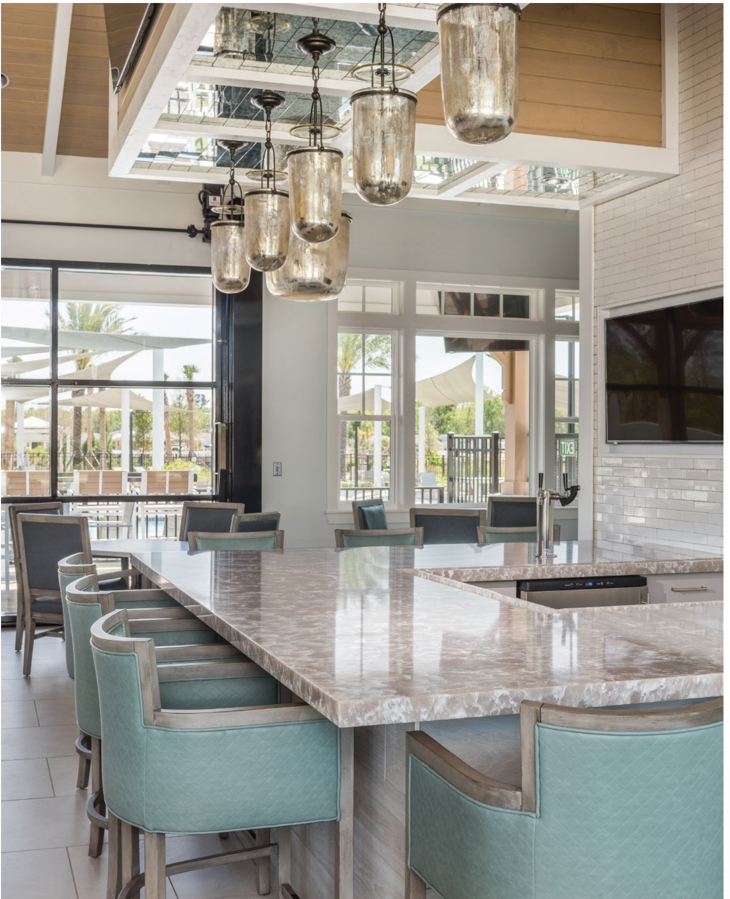
Design Credit: Micamy Design Studio. Featuring: Albany Counter Stool, 8720-C6.