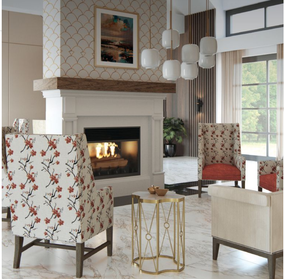
Featuring: Greenbrier Wing Chair, S-7444-01, BenchMade Bench, S-33TF-10, and East Camden Accent Table, 8098-AT.