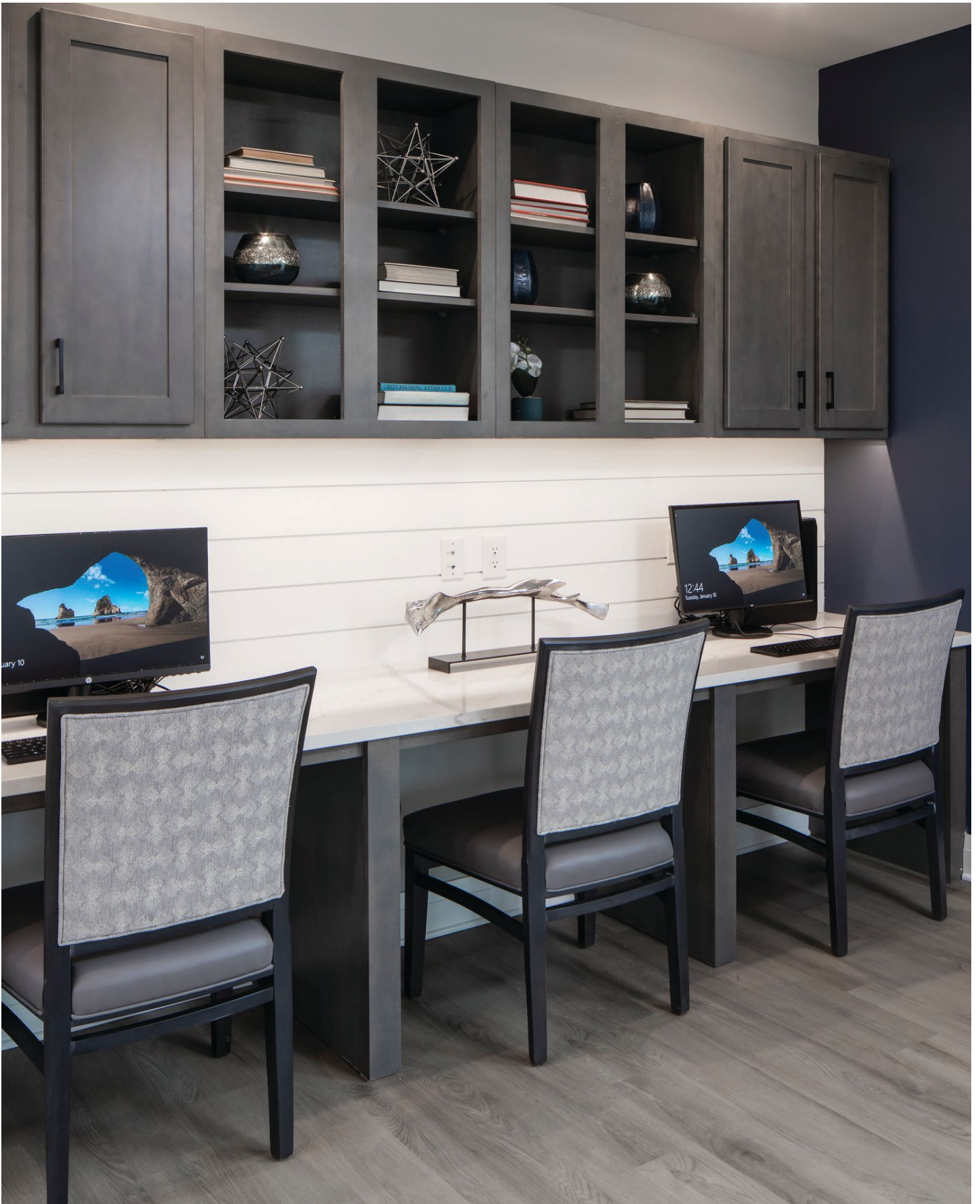
Design Credit: Design East, Medford. Featuring: Plymouth Side Chair, 8411-05.