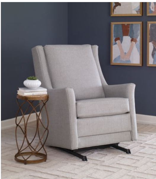
Featuring: Sadie Locking Glide Chair, S-7213-LG.