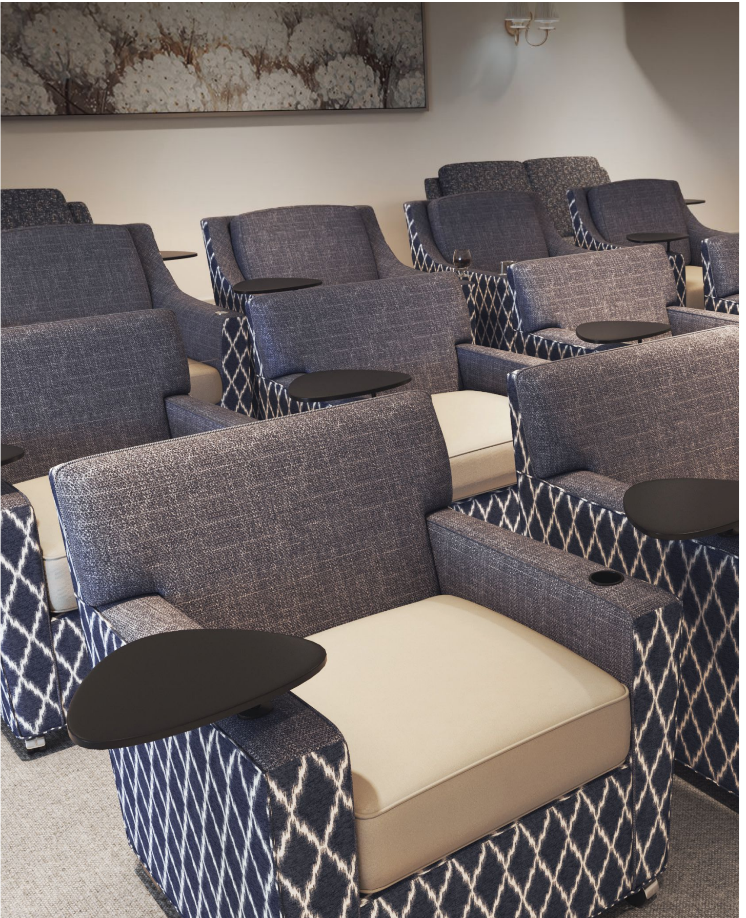
Featuring: Conrad Lounge Chair, S-747C-TH.