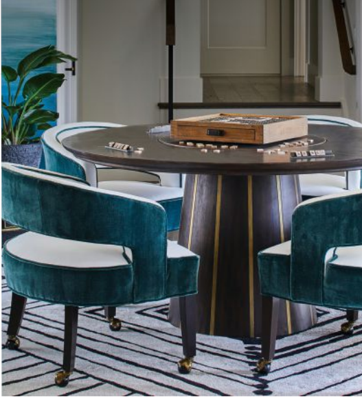
Design Credit: New South Home, Charlotte NC. Featuring: Hayley Arm Chair, 8784-A4.