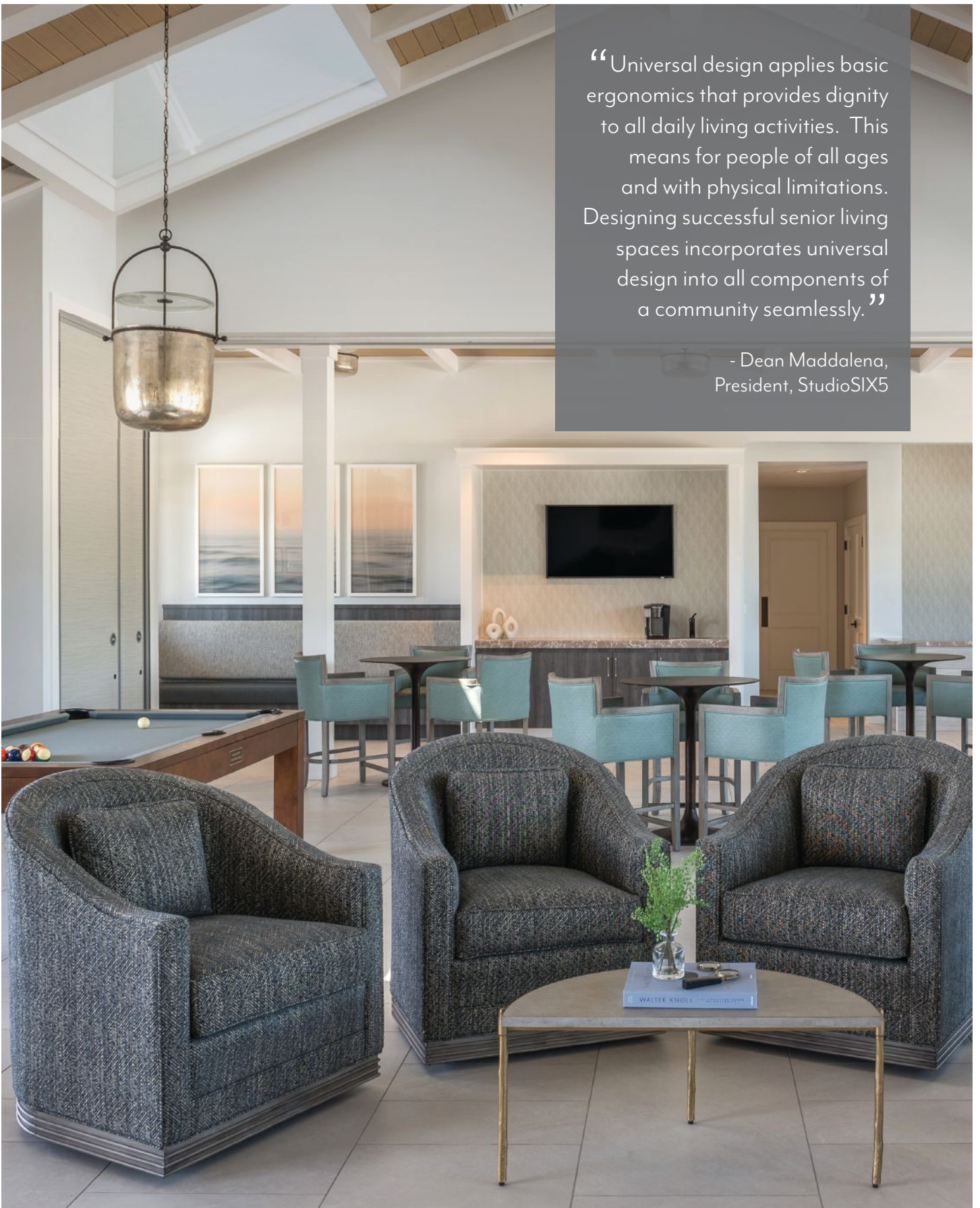
Design Credit: Micamy Design Studio. Featuring: Lyon Swivel Chair, 1111-31 and Albany Counter Stool, 8720-C6.