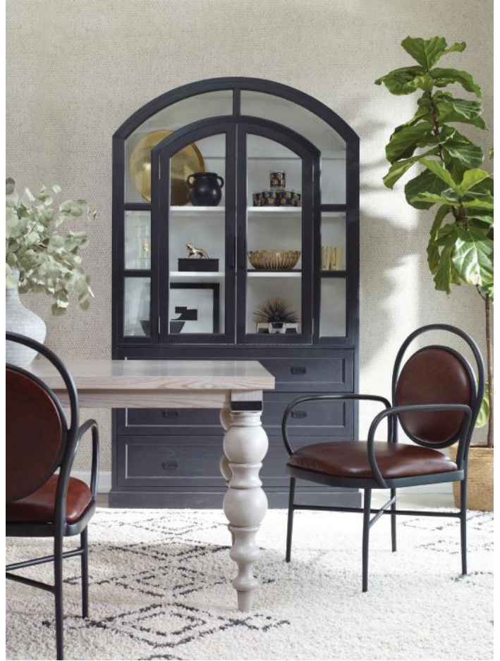
Featuring BD Collection for Fairfield: Warner Leather Dining Chair, F600-04-B, Cooper Dining Table, M201-DT, and Edward Curio Cabinet, 4313-18.